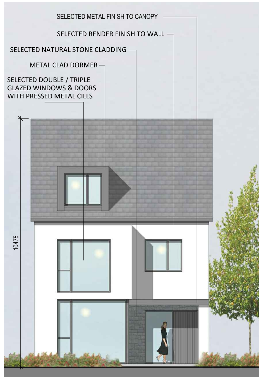
FRONT ELEVATION scale 1:100